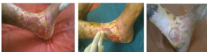
[Table/Fig-7a): Venous ulcer at the time of presentation