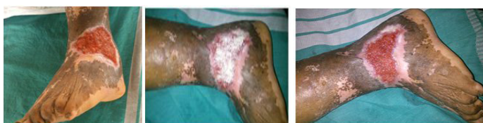
[Table/Fig-6a): Traumatic ulcer at the time of presentation